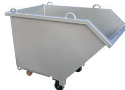
The CSD Self Dumping Bins in nesting design, from .95 to 1.85cu.m 1500kg capacity.