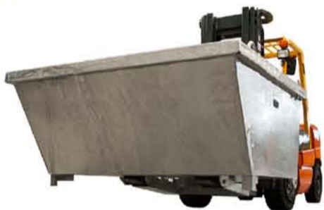
The WFL 1500kg, low profile, Lever Release Tipping Bin for heavy industrial and building waste collection and disposal.