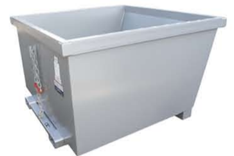
The JSD 3000kg Bulk Self Dumping Bins are a bulk capacity bin for heavy waste from 3.2 to 54. cu.m.