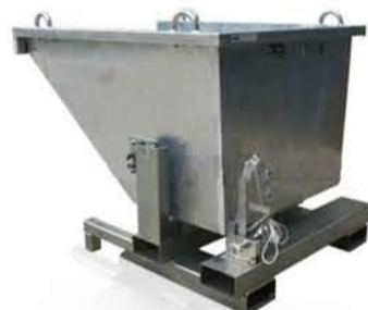
The WRF11X11 1500kg Lever Release Rollover Bin is designed for smooth liquid tipping.