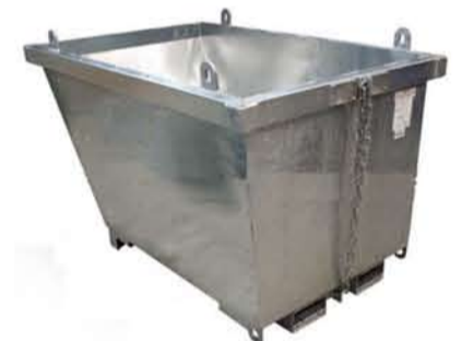
The WFH 1500kg capacity, Self Dumping Bin designed to use forklifts maximum lift.